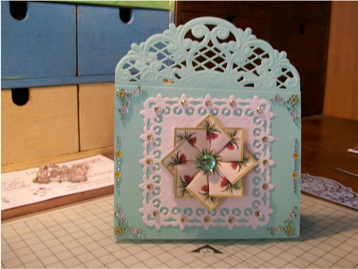
Here are a couple of variations